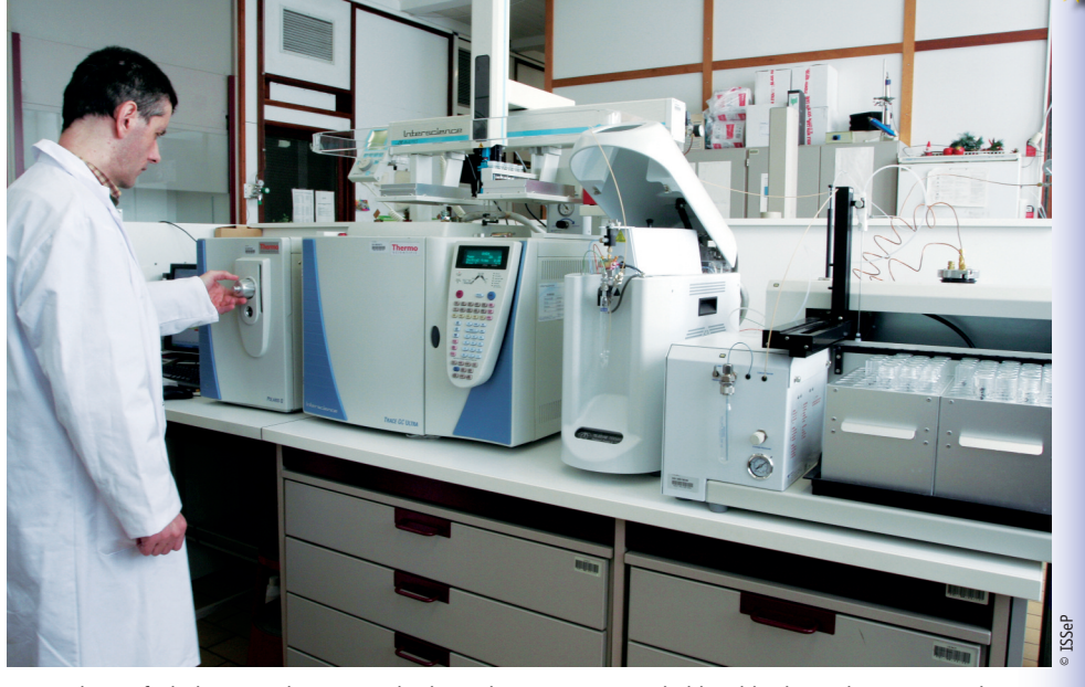
Analysis of aliphatic and aromatic hydrocarbons (VOCs) and chloral hydrates by Purge and Tap coupled with a GC-MS Ion Tap

At the European level, ISSeP is a stakeholder of the PM LAB FUNSTOF project focused on the harmonization of information systems on particle dust. Another important project, APHEIS, focuses on the impact assessment of atmospheric pollution in the Walloon region while the ACCEPTED project (Assessment of changing conditions, environmental policies, time-activities, exposure and disease) assess the quality of the air inside schools and public buildings.